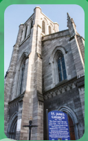
ST JAMES'S CHURCH