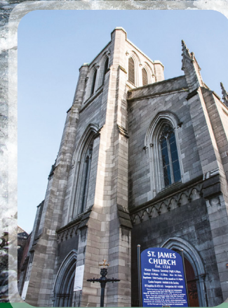
ST. JAMES'S CHURCH