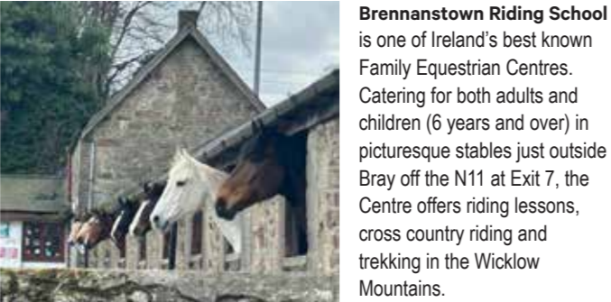
Brennanstown Riding School is one of Ireland's best known Family Equestrian Centres. Catering for both adults and children (6 years and over) in picturesque stables just outside Bray off the N11 at Exit 7, the Centre offers riding lessons, cross country riding and trekking in the Wicklow Mountains.