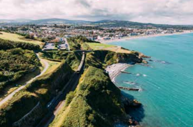
Along Bray's mile long Victorian promenade which starts in the Harbour area near Martello Terrace, the former home of James Joyce author of Ulysses.