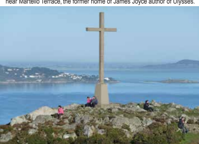
Climb Bray Head to the Cross at its peak and enjoy panoramic views of north Wicklow and south Dublin.